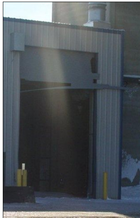
Terminal doors at New Century Ag destroyed by wind.