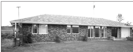
4 Bedroom Home Built in 1984