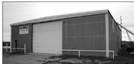
60'X75' Shop Built in 1981