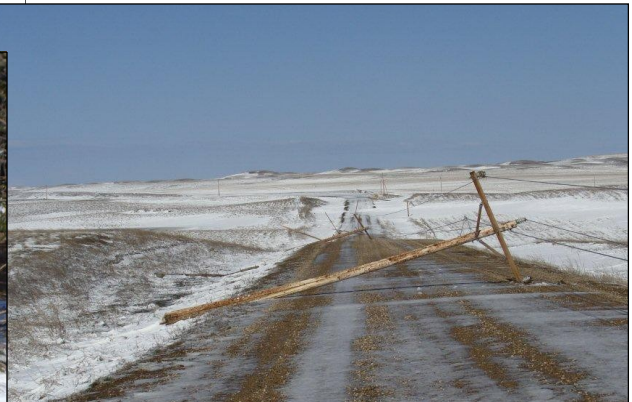
New power line coming into New Century Ag all poles snapped, but one.