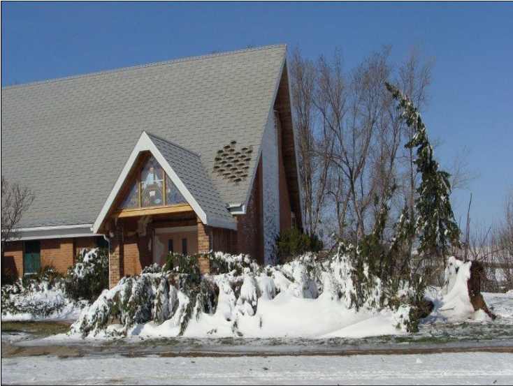
One of many evergreens lost in the storm.