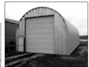
30'X54' Quonset Built in 2005

Located on 15.91 acres, 1/2 mile south of Westby, MT, on the North Dakota side of line. Can be subdivided.